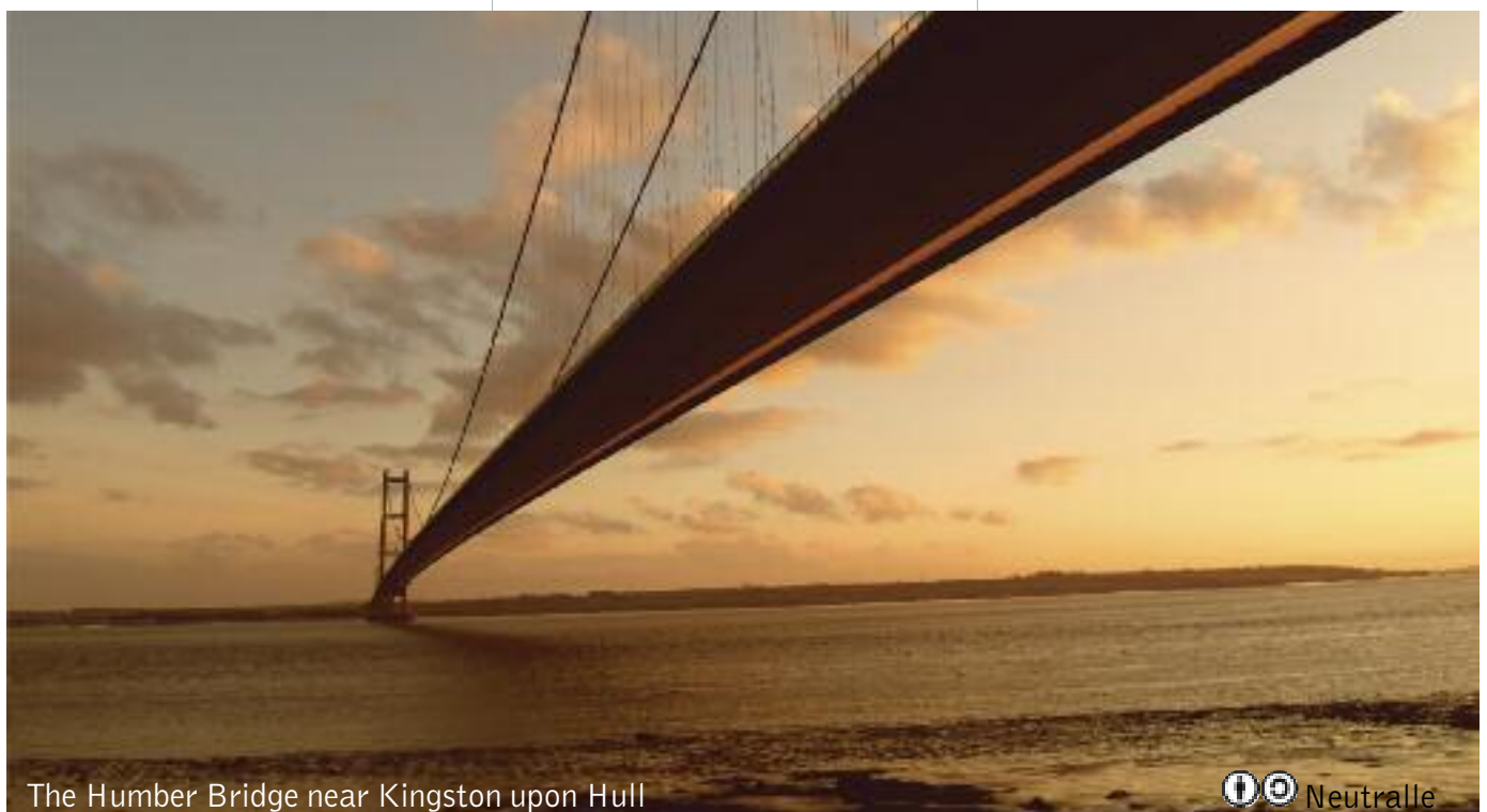
The Humber Bridge near Kingston upon Hull