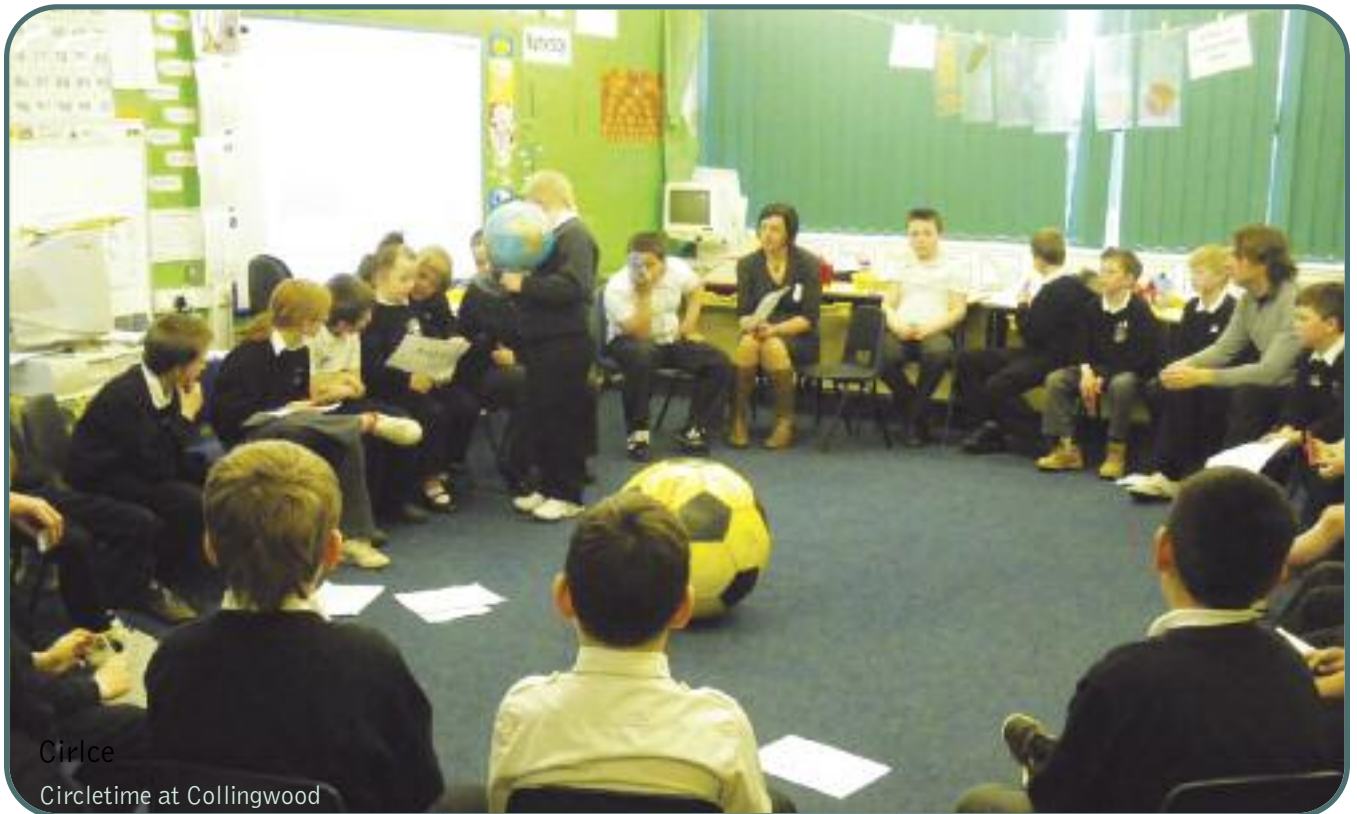
Circle Circletime at Collingwood

If you put your head in at the door of Collingwood you will probably hear laughter coming from the staff room. That's our staff circle where we are sharing funny stories in our 'go around' before we get down to the business of the day. Walk past the staffroom and look into one of our classes where you will see the children sitting in a circle 'checking in' and planning their day. Hear the class identifying their feelings and listen to how the other children offer support to those who need it.